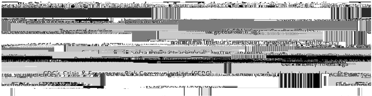
Figure S2. Risk communication frameworks can help diagnose communicative challenges, identify critical information needs, develop audience targeting strategies, and identify appropriate communication channels.